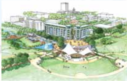
Top - Meridian Monument Plaza, Bottom - Amphitheater