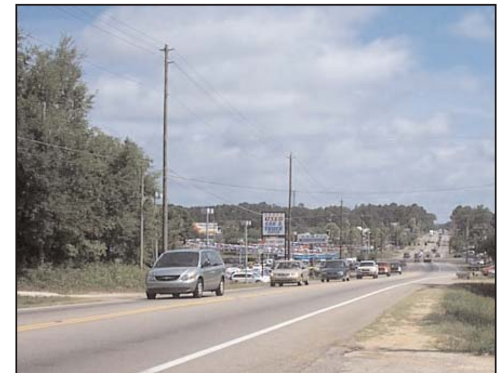
View of Capital Circle within the study limits. This portion of Capital Circle currently carries an average of 32,000 vehicles per day. This volume is expected to increase significantly by the project's 2030 "design year."

between, or to help further develop, resources that already exist. In some cases, Blueprint 2000's role will be the opposite: to acquire property in order to preserve the important resources that may be endangered.