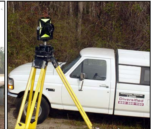
You may have seen a survey crew from Diversified in the field, marking a variety of boundaries important to the Capital Circle NW/SW Study.