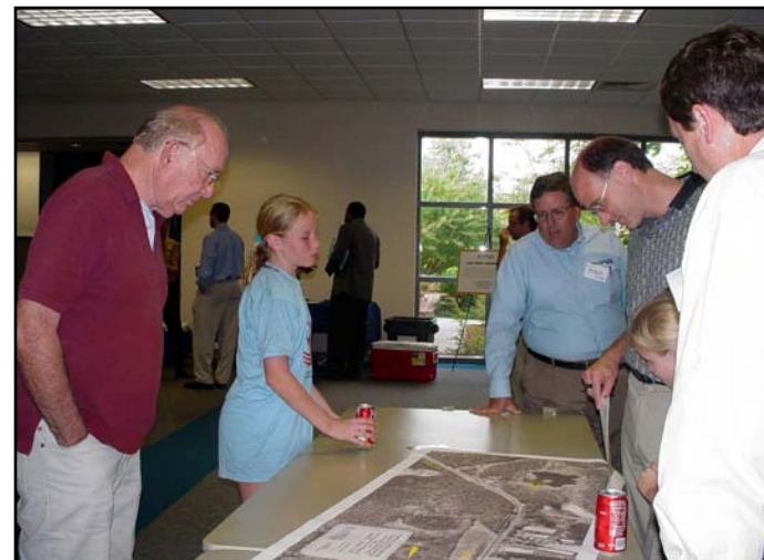
Study area residents review project mapping at the Study's "kickoff" meeting.