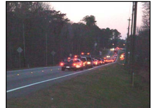
A typical evening traffic back up on Capital Circle NW. A detailed analysis of existing and future traffic volumes is an important early step in the Capital Circle NW/SW Study. Estimates of future traffic volumes are used to develop design concepts and to identify the project's air quality and noise impacts.

Some of this work is already underway. For example, you may have seen some of our surveyors in and about the study area (from Orange Avenue to Tennessee Street). These individuals are surveying the existing facility and adjacent terrain, allowing the engineers to begin their work in developing concepts for how the roadway might be upgraded. Environmental specialists have also been in the study area, gathering information on such items as wetland areas, floodplains, trees, and the presence of threatened and endangered species. Our urban planners have been gathering land use and right-of-way information, along with information about the presence of hazardous materials that could affect the project.