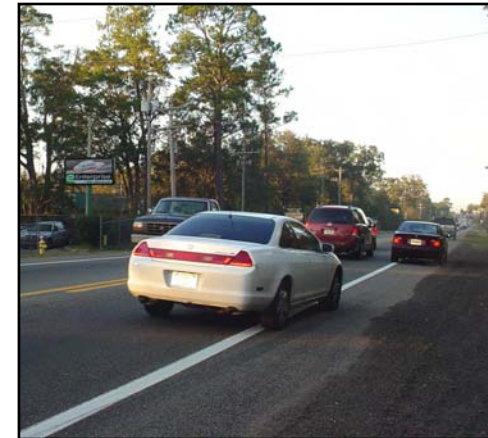
Traffic on Capital Circle SW using the shoulder to go around a car waiting to make a left turn. The proposed improvements would eliminate irregular maneuvers such as these.